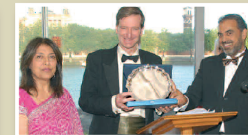
2010 - The Rt. Hon. Dominic Grieve, Attorney General