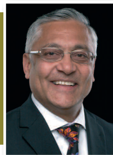
Professor Lord Patel of Bradford OBE