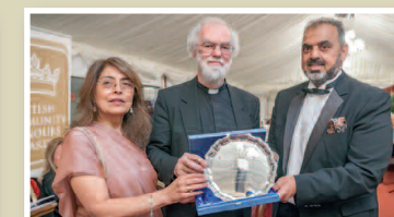
2013 - The Most Revd. Rt. Hon. Lord Bishop Dr. Rowan Williams