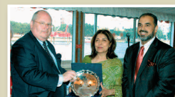
2009 - Eric Pickles M.P. Chairman of the Conservative Party