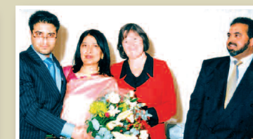
2001 - The Rt. Hon. Clair Short M.P.