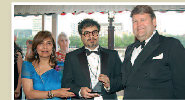
2011 - Lord Strathclyde, The Leader of the House of Lords