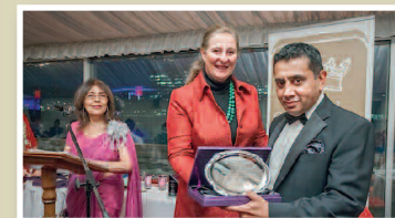
2012 - HRH Princess Katarina and Lord Tariq Ahmad