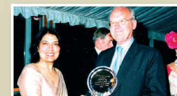
2002 - The Rt. Hon. Lord William of Mostyn, Speaker of the House of Lords