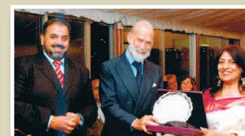
2006 - Prince Michael of Kent