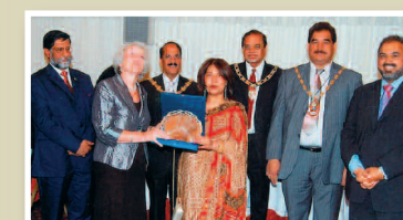
2008 - The Rt. Hon. Baroness Hayman, The Lord Speaker of the House of Lords