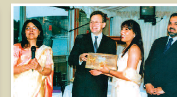
2004 - The Rt. Hon. Lord Goldsmith Attorney General