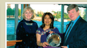
2007 - Earl of Errol, Lord High Constable of Scotland