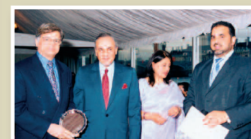
2003 - HRH prince Turki Al Faisal Ambassador of Saudi Arabia in London